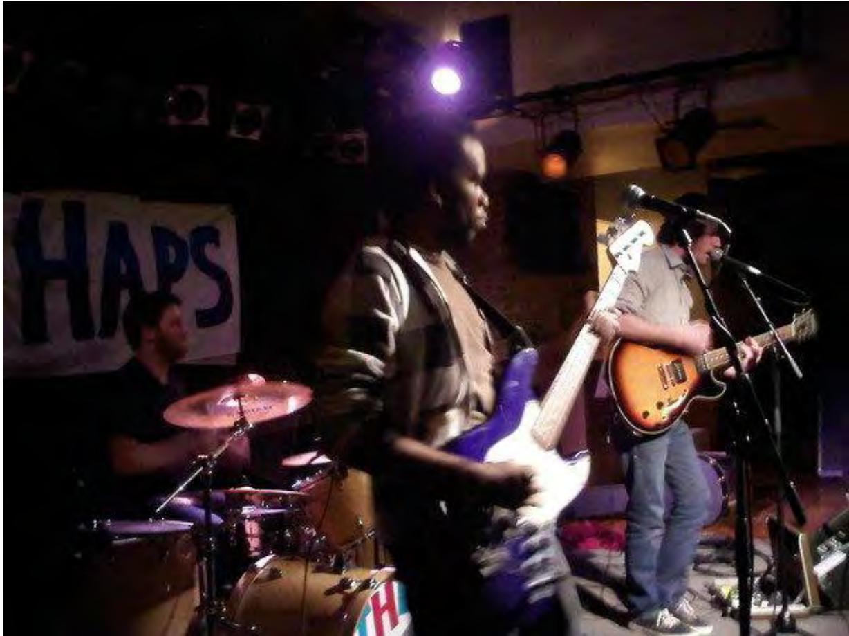
Far Away Planes - http://www.purevolume.com/farawayplanes