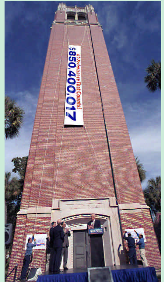
Officials announce the successful conclusion of UF's five-year capital campaign at the base of Century Tower on the UF campus.