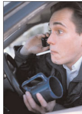
Resource counseling can help you deal with stress — school-related or otherwise.

I am interested in your ideas and suggestions, and hope you include them on the survey. Please pick one up in Student Affairs and return it to the envelope labeled “Resource Counselor Surveys” outside Student Affairs. I hope to hear from you soon.