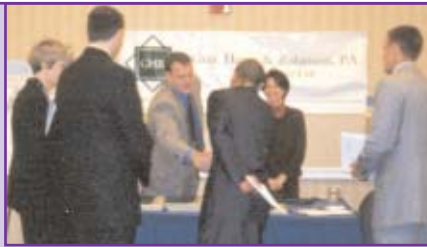
Meeting practicing attorneys and learning more about specific fields of practice was a highlight of the 2002 conference, and participants this year will have even greater opportunities to do so.