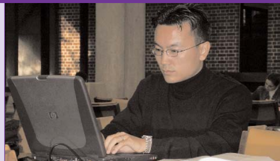
Get important job information through the Career Services Hotline. Sign up at www.law.ufl.edu/career/resources/hotline .

Many firms in addition to those who come to On-Campus Interviews (OCI) list jobs through Career Services, making the online service eAttorney.com a valuable job search tool even if you don't participate in OCI. Just go to www.eAttorney.com , log on, then click on "Career," then "Job Bank," then "School Job Search" to search by practice area, geographic