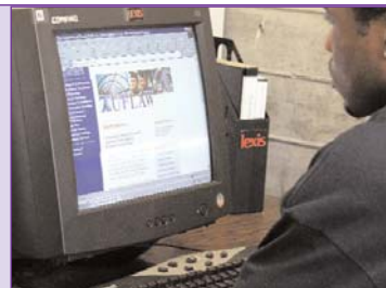
Pre-register now online through ISIS.