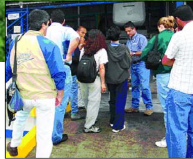
Conservation Clinic students tour chemical mixing facilities at a Standard Fruits airport for aerial fumigation.

14001 certification precluded finding Standard liable for contamination. However, ISO 14001 is not international law and does not preclude liability for a company in Costa Rica.