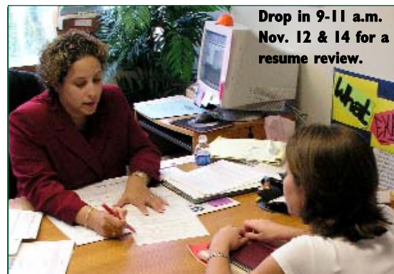
Drop in 9-11 a.m. Nov. 12 & 14 for a resume review.