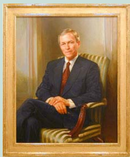
Gov. Kenneth "Buddy" MacKay (above, in his "Governor's Portrait") is a UF law adjunct professor.