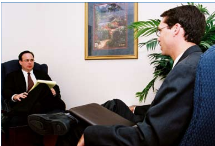
Two-thirds of all law students receive a job offer before finishing law school, according to the National Association for Law Placement.