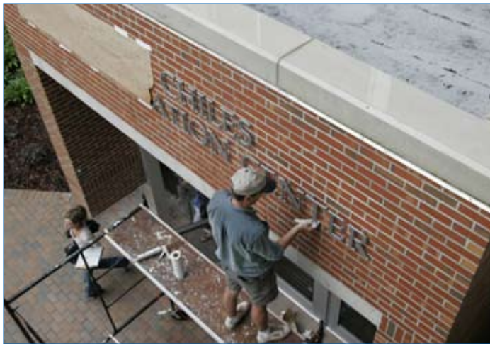
A construction worker puts up a sign at the entrance to the Lawton Chiles Legal Information Center. The dedication of the new library will be held this week.

U.S. Supreme Court Associate Justice Sandra Day O'Connor, members of the Florida Supreme Court and a host of other dignitaries will be on the law school campus this week, as the Levin College of Law celebrates the dedication of its newly refurbished facilities.