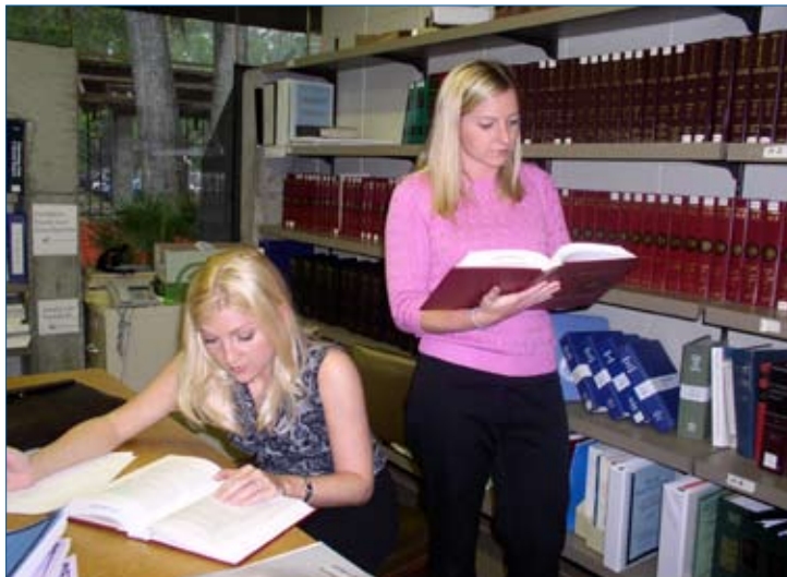
Pictured here are two students working in the law school's Pro Se/Unbundling Clinic. Clinics give you the chance to experience the practice of law before graduation: applications are being accepted this week.