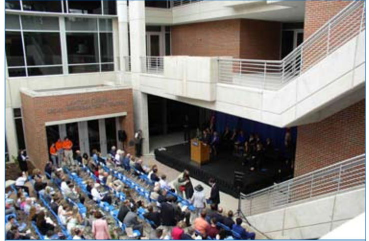
The law school's new facilities (shown here during dedication ceremonies on Sept. 9) will help usher in a new era of excellence.

The heart of our institution is our faculty, and they have been very productive in their teaching and research. (I invite you to read more about recent faculty accomplishments in our 2005 Report From the Faculty , available online as a link from our publications page at http://www.law.ufl.edu/news/publications.shtml .) One of the major challenges we will soon face at the college comes from the reality that 12 of our nearly 60 tenure-track faculty have announced plans to retire in the next five years, and seven