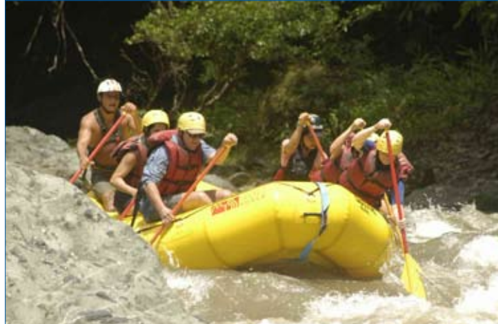
Whitewater rafting through the tropical rainforest is just one of the adventures that can await you in summer study abroad programs.