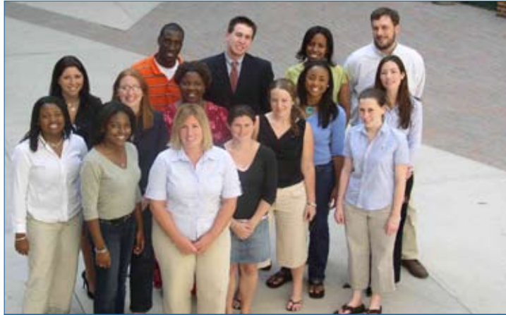
The Admissions Office is seeking new members for the Student Recruitment Team, an all-volunteer group that recruits prospective students to the Levin College of Law.