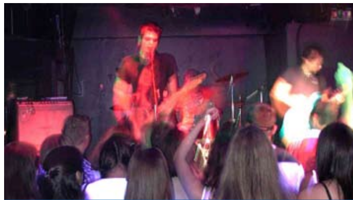
The annual Music Law Conference hosts a showcase of bands (shown here are performers from the 2003 event) and is just one of several exciting conferences to be held this semester.

The conference is the first event organized by the newly-