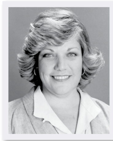
Florida's feminist firebrand