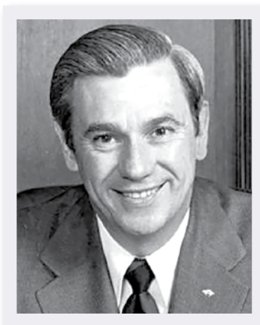
Public servant for the ages