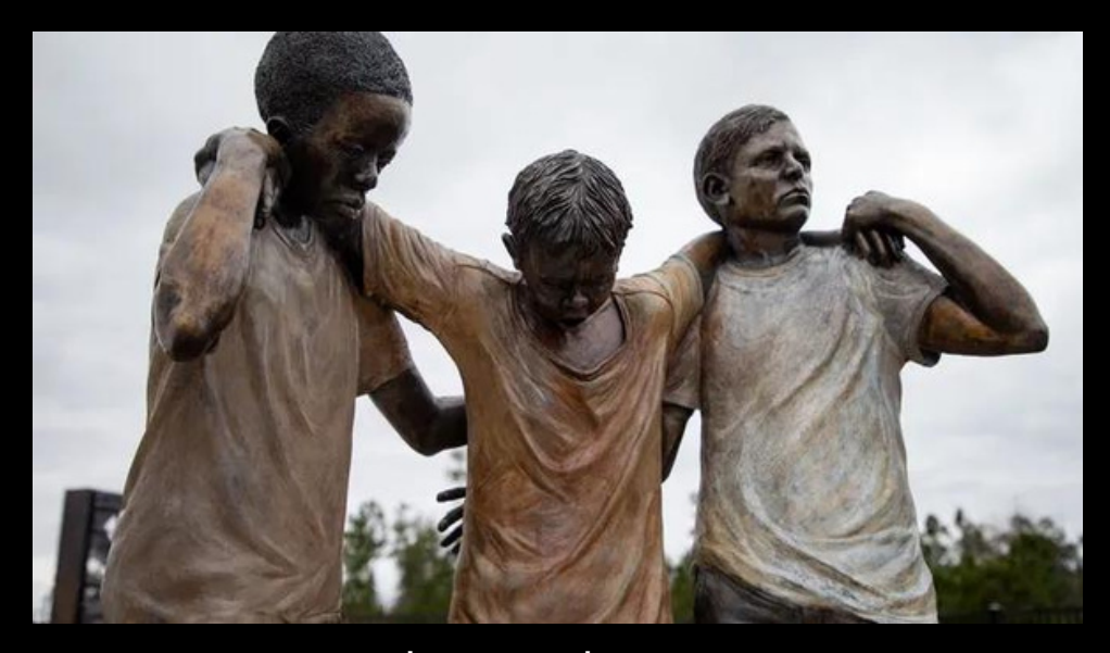
Dozier Memorial erected in 2023